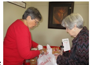
Bette finds a treasure